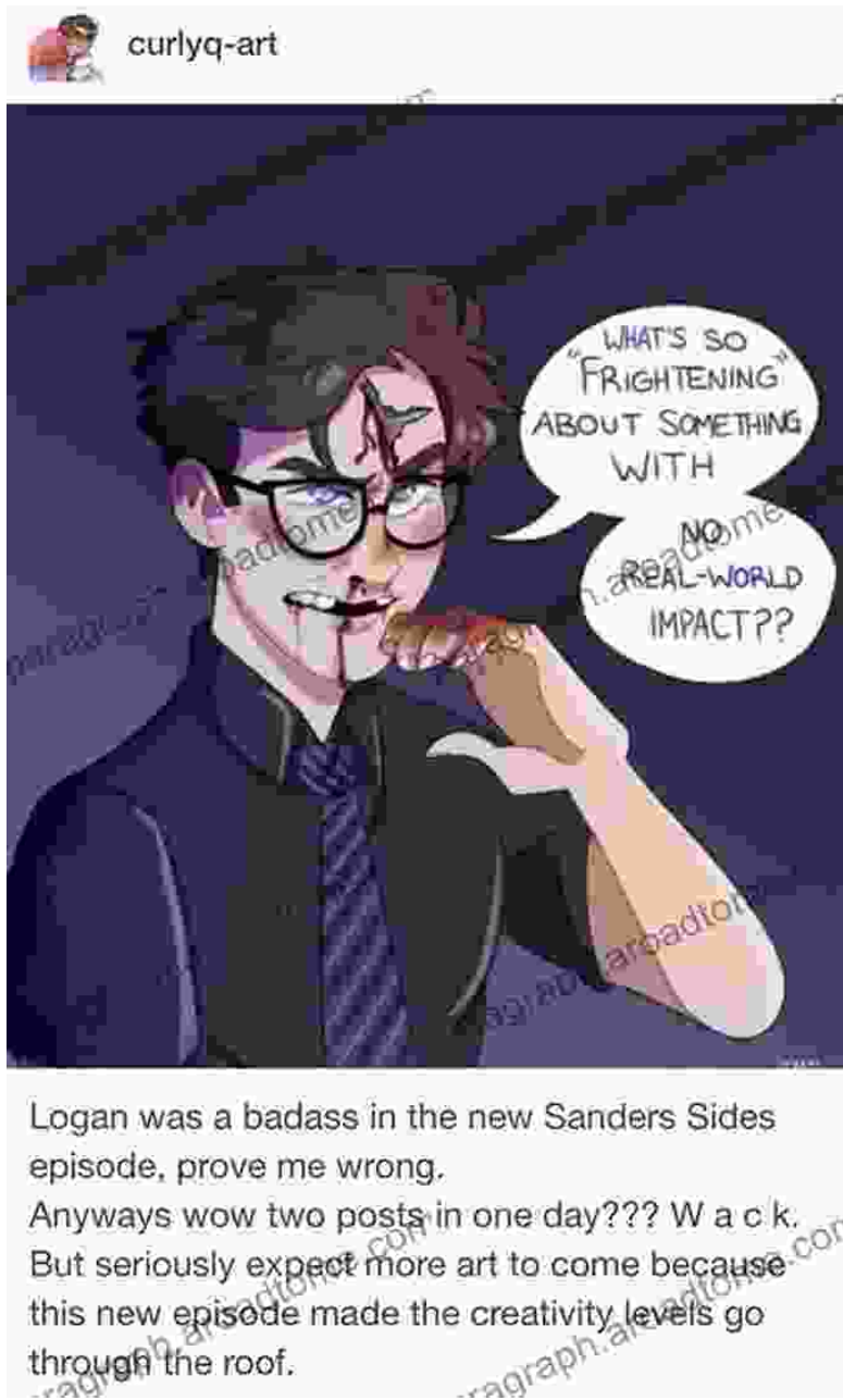
Logan was a badass in the new Sanders Sides episode, prove me wrong. Anyways wow two posts in one day??? W a c k. But seriously expect more art to come because this new episode made the creativity levels go through the roof.