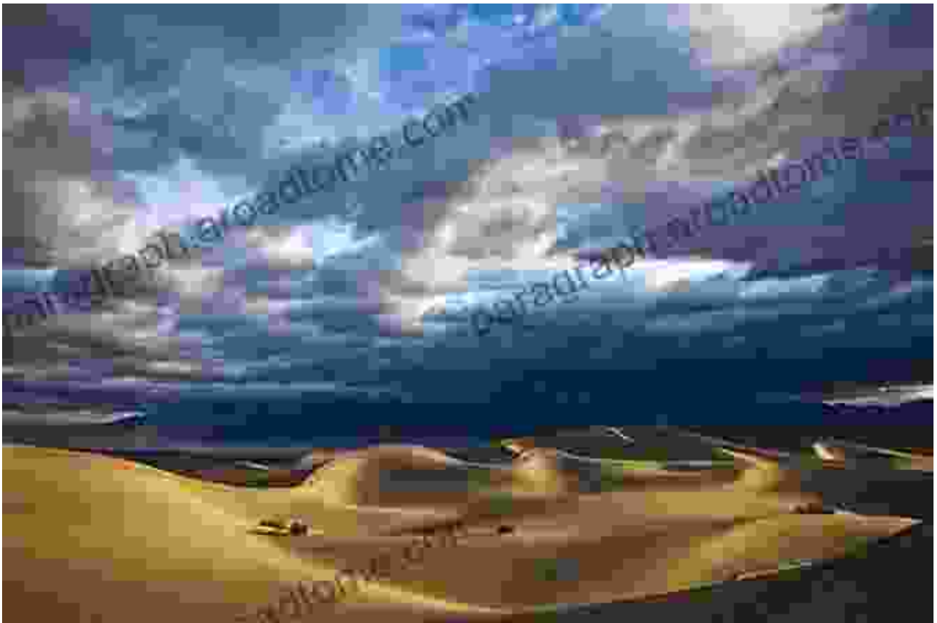
The Long Road of Sand by Pier Paolo Pasolini